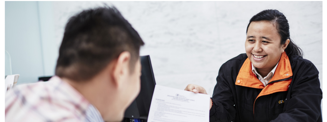
Customer service officers are well trained to respond to consumer queries and feedback

In FY 2014, CEA concluded 600 complaint cases, of which 331 were substantiated and 167 unsubstantiated. Estate agents resolved 13 cases while 89 cases were found not to be under the purview of CEA or referred to the Police.