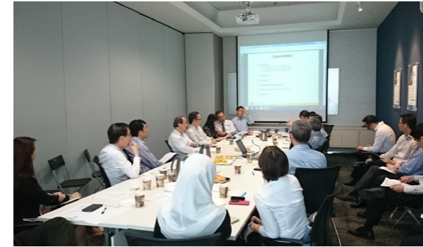
Industry stakeholders engaged in a CEA workgroup discussion

CEA also worked with the Personal Data Protection Commission on the Advisory Guidelines for the real estate agency industry to address various situations faced by the sector in complying with the Personal Data Protection Act and its Do Not Call provisions. The guidelines were published in May 2014.