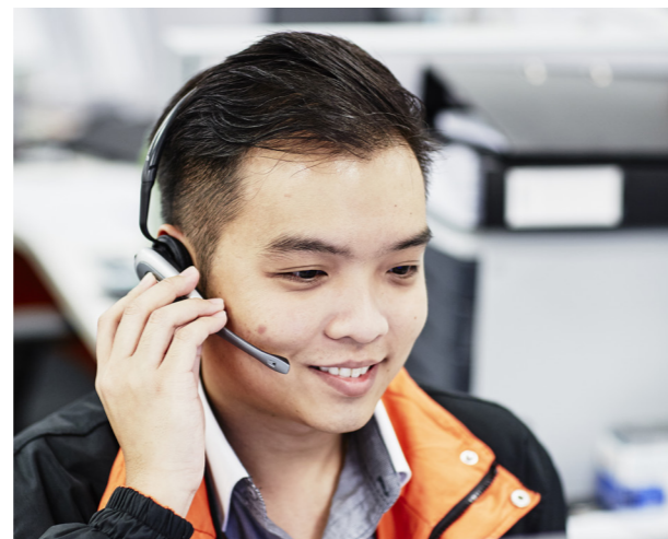
CEA received over 40,000 calls in FY2014

CEA received a total of 702 complaints in the year, down from 751 complaints in FY2013. The top three complaints were related to advertisements that carried misleading information or improper distribution of flyers, unprofessional services rendered by salespersons and salesperson misconduct.