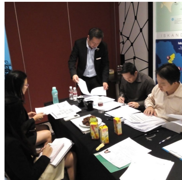
Inspection at the premises of an estate agent

In June 2014, CEA issued the Practice Guidelines on Conduct between Salespersons to provide guidance on the standard of conduct and ethical behaviour expected among industry practitioners. The guidelines spell out the general duty of salespersons towards other salespersons, and the conduct to be observed in relation to exclusive listings, and co-broking for exclusive and non-exclusive listings. It also covers ethical standards required of estate agents' team leaders and members.