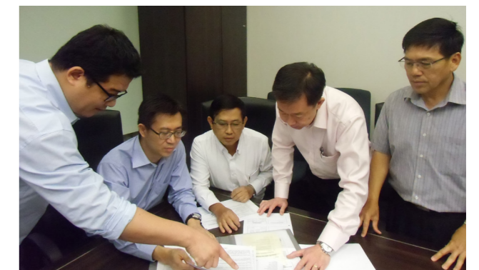
Staff from various divisions discussing a prosecution case