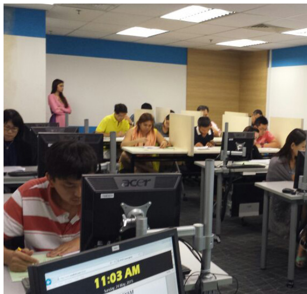
The RES examination syllabus was revised in response to industry developments

All real estate salespersons are required to pass the Real Estate Salesperson (RES) examination before they can apply for registration to carry out estate agency work in Singapore. Likewise, Key Executive Officers (KEOs), practising directors and partners are required to pass the Real Estate Agency (REA) examination. To prepare new