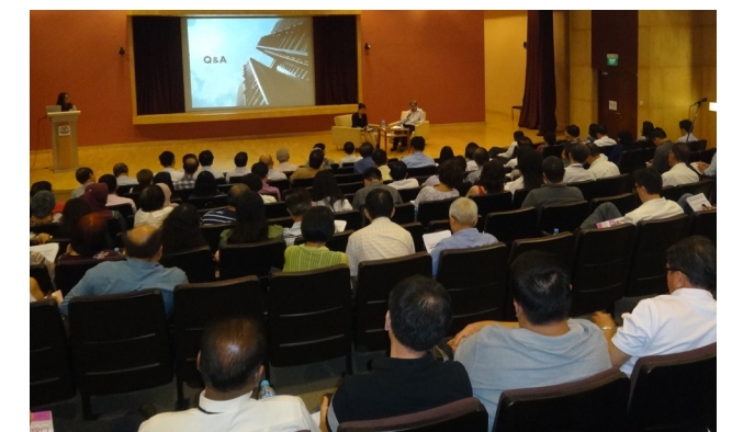
CEA-CAD joint industry outreach session on anti-money laundering and countering of financing of terrorism

In October 2014, CEA conducted a joint outreach-cum-briefing session for KEOs in partnership with the Commercial Affairs Division, to enhance industry awareness of anti-money laundering/countering the financing of terrorism (AML/CFT) issues. The session was a core CPD activity. In addition to a briefing on CEA's Practice Circular on the Prevention of Money Laundering and Financing of Terrorism, attendees were also reminded to undertake customer due diligence measures to mitigate the risk of money laundering or terrorism financing activities in property transactions. A total of 150 KEOs attended the event.