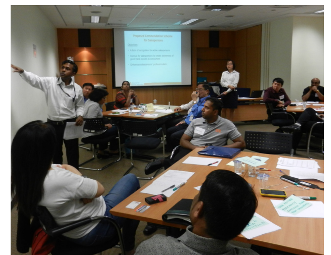
Salespersons engaged in a focus group discussion

CEA also held three dialogue sessions with the industry associations, namely the Institute of Estate Agents, SAEA Ltd and the Singapore Institute of Surveyors and Valuers (SISV). These dialogue sessions provide an additional channel for CEA to engage and work closely with the