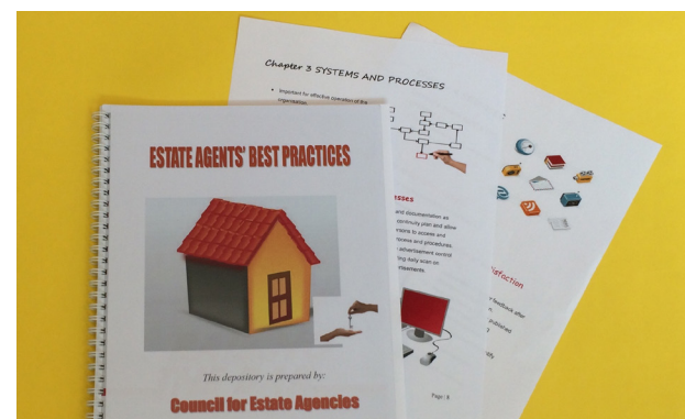
Online best practices depository for estate agents

In October 2014, CEA formed a working group to encourage the use of exclusive estate agency agreements by consumers. The working group, consisting of members from estate agents, industry associations and the Consumers Association of Singapore, will deliberate on measures to encourage greater adoption of exclusive agreements so as to minimise duplication of efforts in the conduct of estate agency work and to enhance industry productivity.