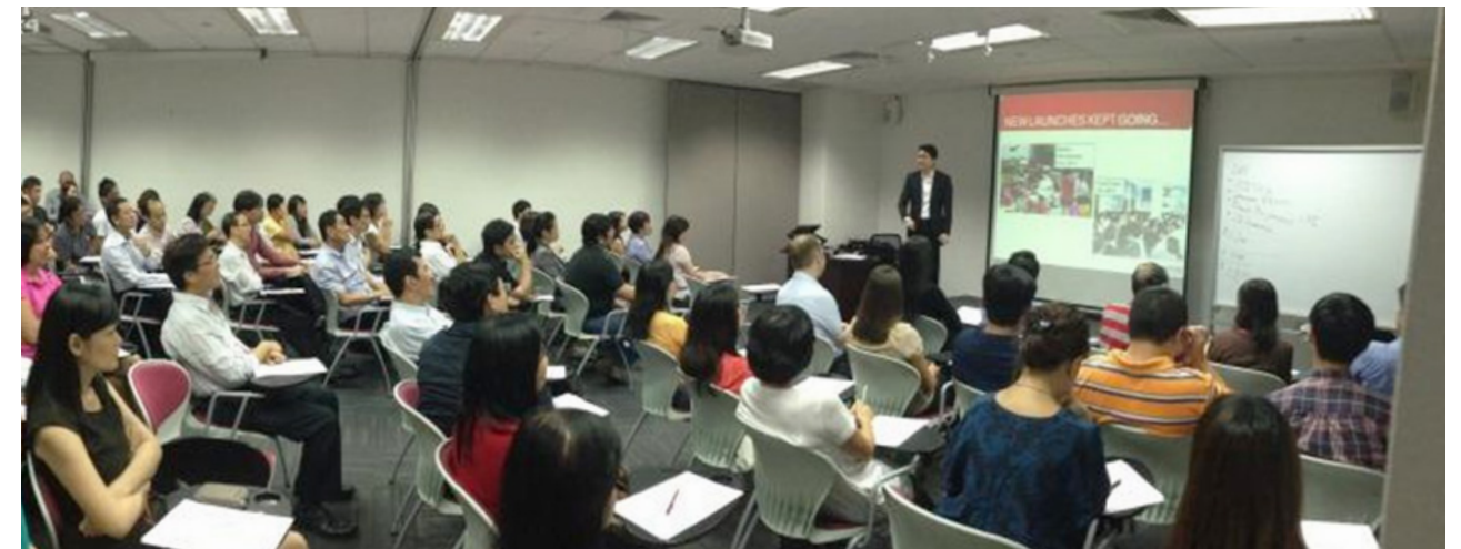
Continuing professional development is mandatory for the industry

To keep pace with ongoing industry changes and developments, the REA examination syllabus was revised in January 2015. This revised syllabus will take effect in July 2015. Similar to the revised RES examination syllabus, the revised REA examination syllabus provides clearer elaboration of the expectation of REA examination requirements. Learning outcomes and expectations of cognitive levels for each learning outcome were introduced to facilitate better appreciation by ACPs and REA examination candidates of the level of understanding required for each topic. With effect from July 2015, modular re-sitting for the REA examination will be allowed.