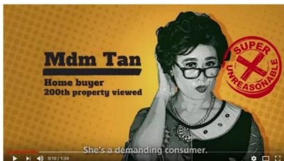
Be a happier consumer...and don't be like Mdm Tan hor!

As part of the campaign, we ran advertisements on two radio stations, and in about 200 bus shelters to reach the general public. These ads generated buzz when some property agents took issue with the phrasing of the content, mistaken that CEA was encouraging more do-it-yourself transactions.