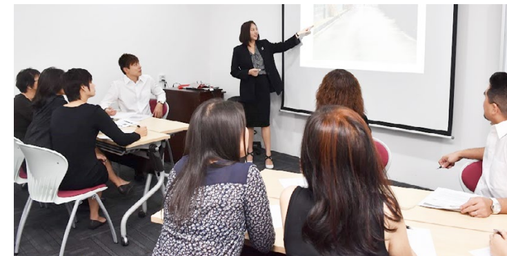
The CPD Training Roadmap is a definitive framework to guide industry practitioners in building capability and professionalism

professionalism in the industry. It is a key tool for Key Executive Officers (KEOs) and property agents to broaden and deepen their knowledge, as well as keep abreast of developments in the industry.