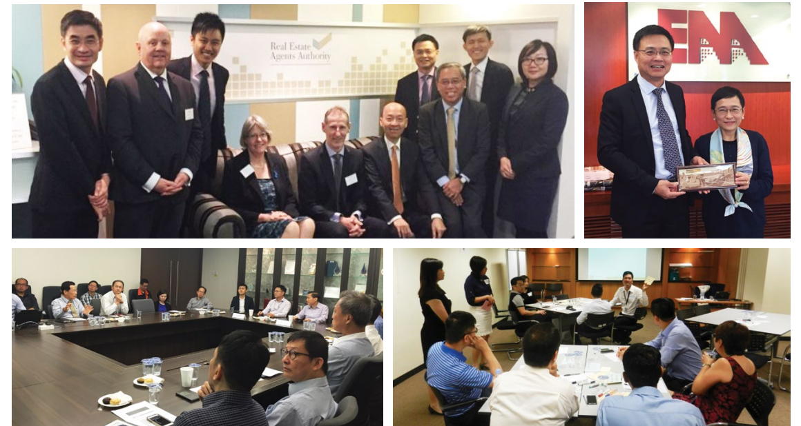
Connecting with KEOs and property agents through dialogues and discussions allows CEA to have a better sensing of ground issues

explain our policies to them, as well as seek input on future plans. We gained useful insights to enable the successful implementation of upcoming initiatives, policies, and industry improvements. Industry input is invaluable to CEA as it allows us to constantly review and refine our processes so that they are in tandem with the times and are relevant to the industry.